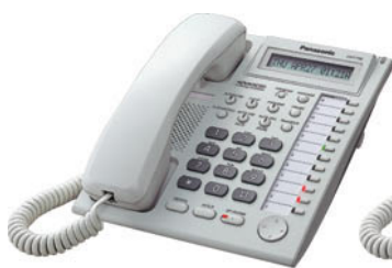
■ KX-T7730 Speakerphone Unit