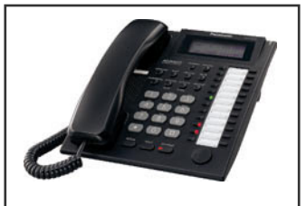
Units available in Black and White