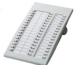
■ KX-T7740 DSS Console