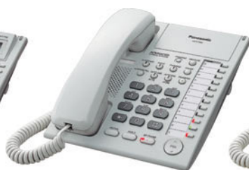
■ KX-T7720 Speakerphone Unit